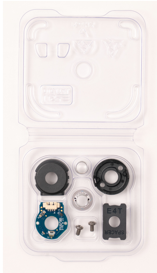
New Clamshell Packaging (open)

This change does not affect form, fit or function of the final product.